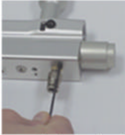
1. Remove the bottom body plug from the underside of the body

The tapeworm is designed to aid in the re-cock function of the Impulse. Normally, an Impulse requires back pressure provided by a paintball to re-cock properly. After installing this part, you will notice you'll be able to dry-fire your Impulse without the bolt staying forward, and also be able to run it at a lower pressure without re-cock problems. The tapeworm does this by restricting air pressure from leaving the air chamber, which prevents pressure drop in the air chamber feeding into the 4-way solenoid.