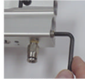
3. Remove the front air chamber plug from the front of the body.