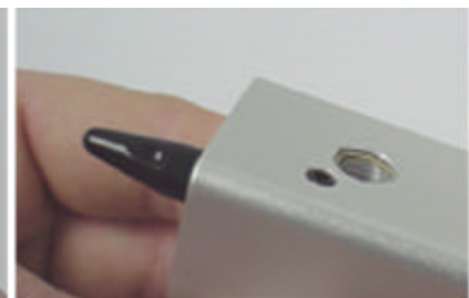
10. Install set screw until flush with underside of body.