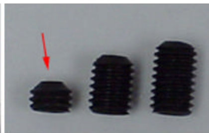
9. The smallest set screw should only be used with the factory fore grip. Use red loctite #271.