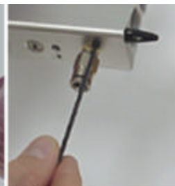
7. Using the medium bottom body screw supplied, apply red loctite and insert screw into underside of body. Screw in snug, but do not over-tighten. Over-tightening could damage the tapeworm.