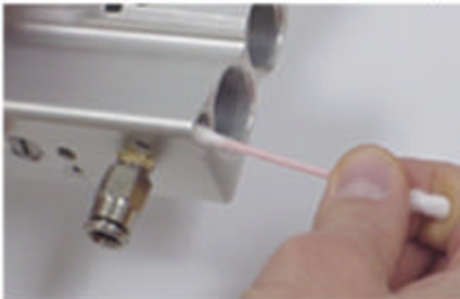
4. Clean both holes with a Q-tip and alcohol.