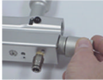
2. Remove the valve end cap from the front of the body.